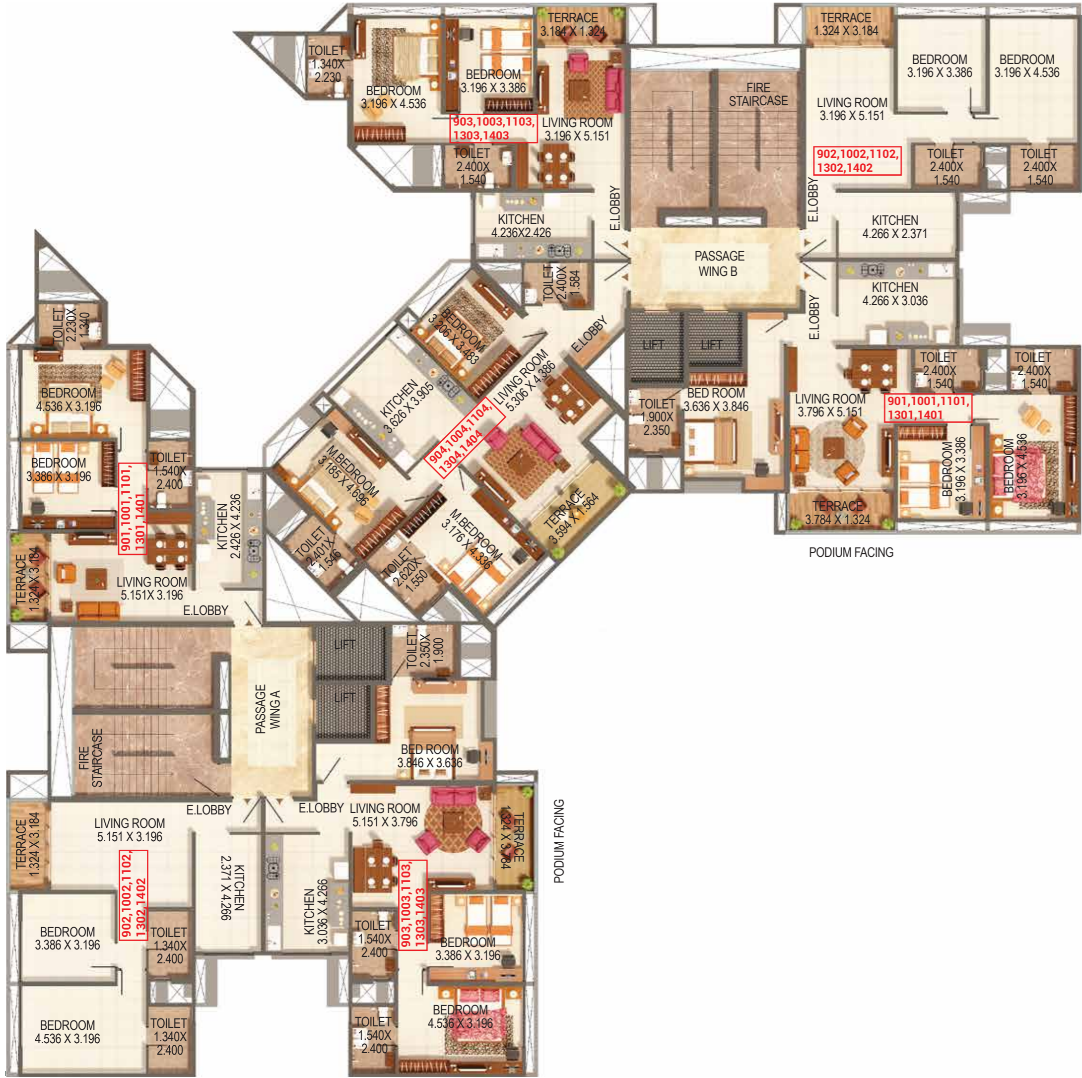
BUILDING 'B2' 9th,10th,11th,13th,14th FLOOR (AREA IN SQ. M)