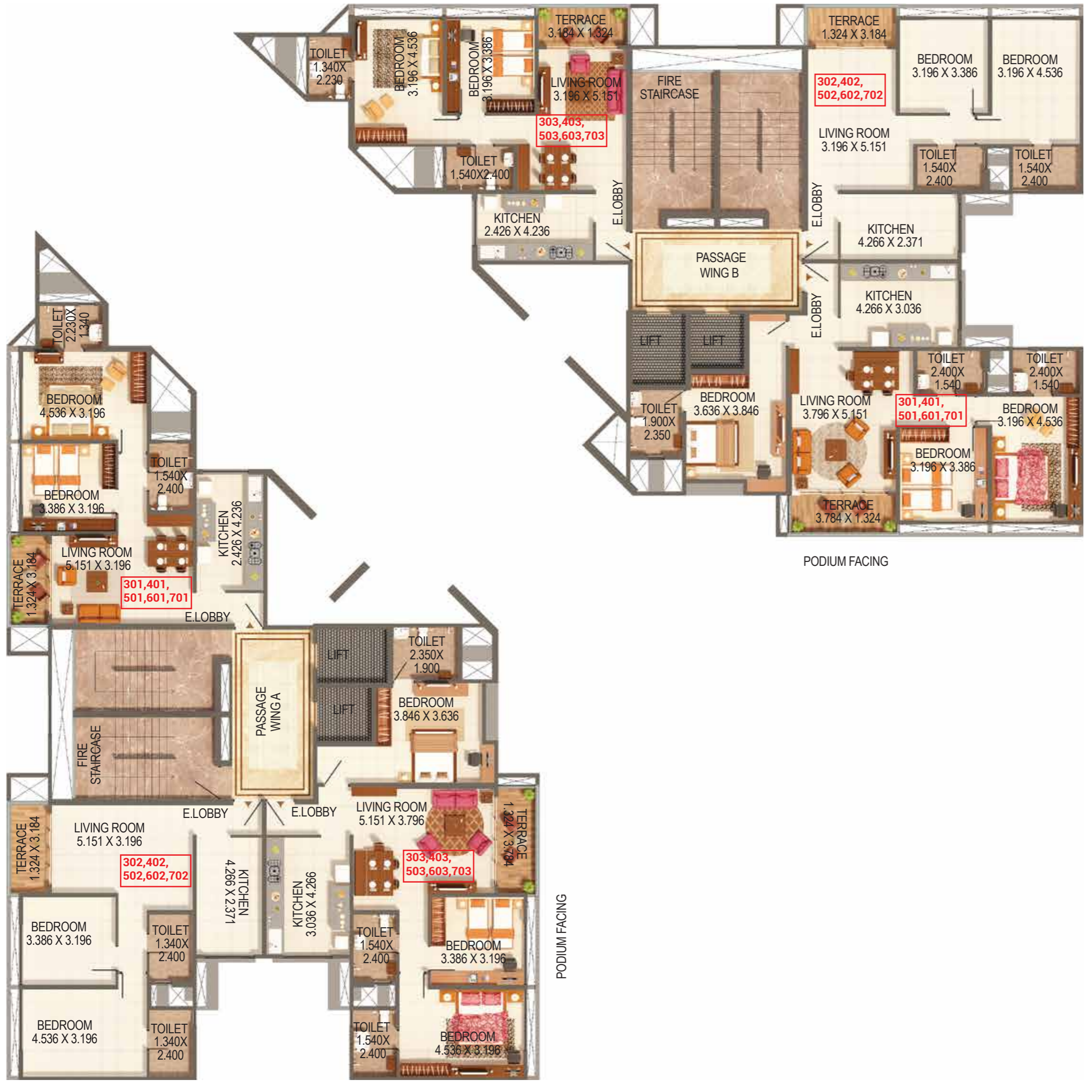
BUILDING 'B2' 3rd to 7th FLOOR (AREA IN SQ. M)