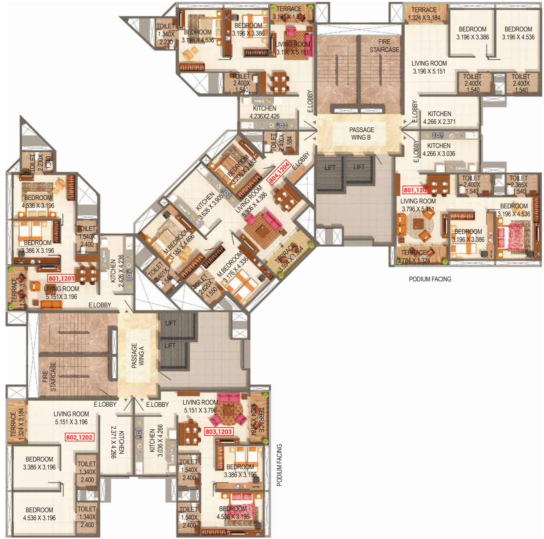
WING 'B2' 8th,12th FLOOR (AREA IN SQ. M)